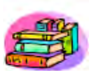
table and we will attach it to the book's card so that you will be the next member to borrow the book.

Placing A 'Hold' On a Book - Is the book you want already signed-out to another quilter? Print your name on a post-it note available at the library